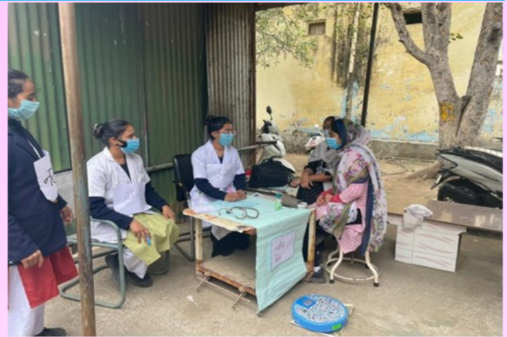
HEALTH TALK BY GNM 1 ST YEAR STUDENTS