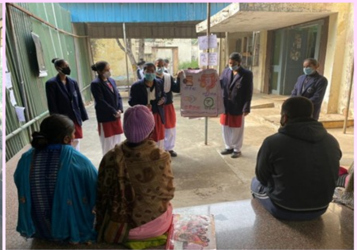
ORIENTATION OF GNM 1 ST YEAR AT RHTC, NAJAFGARH